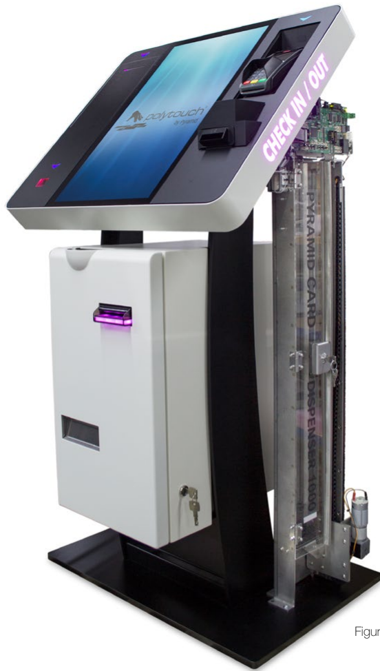
Figure shows configuration variant