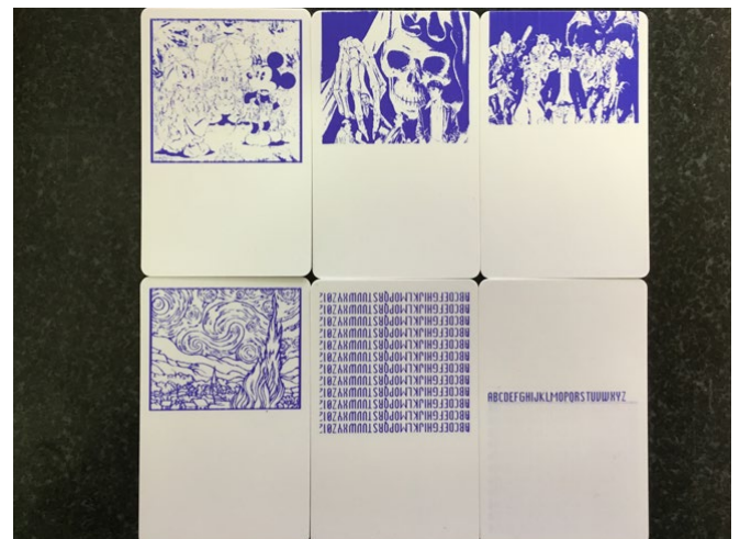
Examples of card customizing